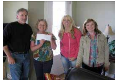
Getting Ready for the Scavenger Hunt