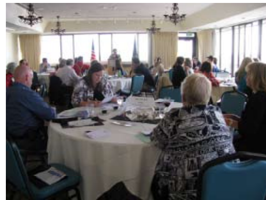
There were nearly 50 participants at our inaugural "Roundtable" Forum.