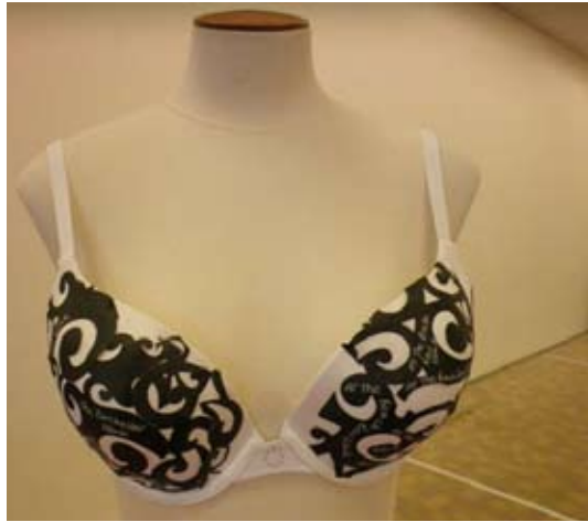
Cham-Bra of Commerce – 1st Place Business Category

We are so pleased to announce that the Lincoln City Cham-BRA of Commerce won the Relay for Life Art Bra Contest!