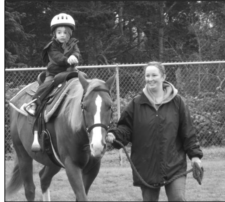
Green Acres Boarding at Artober Brewfest

"We offer guided Beach Rides from our exclusive location near Bob Straub Park in Pacific City, and Mountain Trail Rides directly from the facility in Lincoln City."